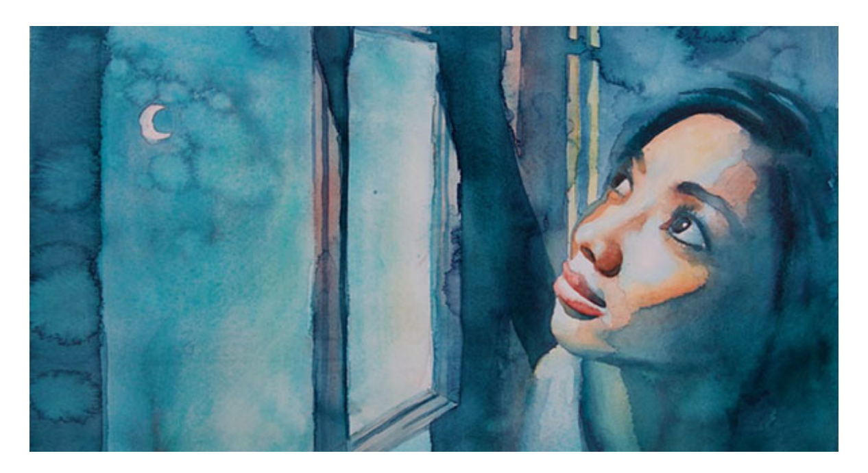
Perverse and foolish oft I strayed, But yet in love he sought me, And on his shoulder gently laid, And home, rejoicing, brought me. Hymn, The King of love my Shepherd is 1868.